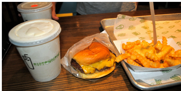
The Shake Shack, Dupont Circle, Washington, DC