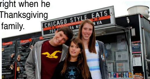
Windy City Red Hots, Ashburn, Virginia