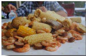
Frogmore Stew, Leesburg, Virginia