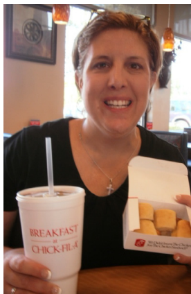
Chick Fil A, Warrenton, Virginia

We spent the month of September back in the US so that we could reconnect with friends, family, churches and supporters of our ministry here in Guatemala. Virtually every meeting and certainly every road trip had us enjoying some good eats. We were, in a word, spoiled.