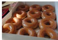
Krispy Kreme, Fredericksburg, Virginia