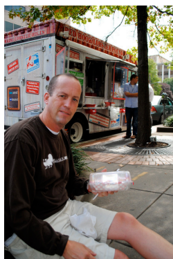
Red Hook Lobster Truck, Washington, DC